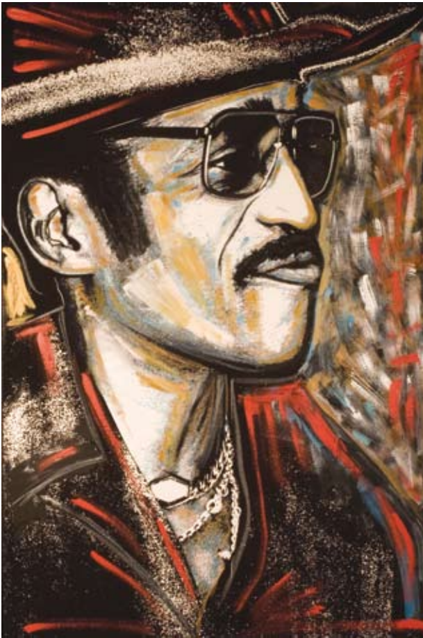
Sammy Davis Junior